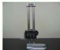
DIGI HEIGHT GAUGE