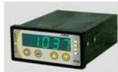
DIGITAL PRESSURE INDICATOR