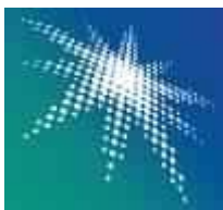
Aramco Vendor Code:10061414

We work closely with wide range of customers from different sectors and regions across public sector, private sector, local and national government industries. Below are some of our main clients we are proud to work with: