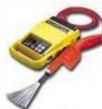
DC HOLIDAY DETECTORS