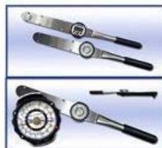
DIAL TORQUE WRENCH