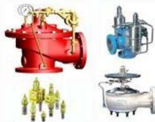
PILOT OPERATED SAFETY RELIEF VALVE