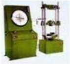
COMPRESSION TESTING MACHINE