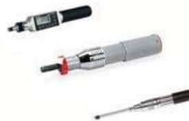
TORQUE SCREW DRIVER