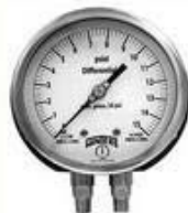
DIFFERENTIAL PRESSURE GAUGE