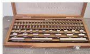
GAUGE BLOCK LIST